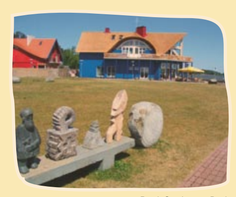
Rock Sculpture Park.

From Juodkrantė you take a cycle trail south along the seashore towards Nida. Passing the beached marked with the blue flag, you go on