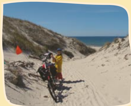
Dunes of the Baltic seashore.

Juodkrantė you'll see the Prie Švyturio Rest Area where you can stop for a short rest. If you want to build a fire there, you must obtain a permit from Juodkrantė Forestry (22). After resting you continue your trip and soon come to an asphalt pedestrian-cycle trail, which links the beach with the centre of Juodkrantė (1.5 km). If you want to look around Juodkrantė and continue your trip to Nida, you'll have to get over a high dune twice and in the town itself. Go another 6 km as