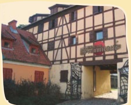
Old Town of Klaipėda.

tants of Klaipėda died during the 1709-1711 plague, Prussian King Fridrich I began colonisation of the land (about 200 people from Salzburg arrived in the city). In the 18th century the Lithuanian Catholic community, Mennonites, and Anglicans joined the integral Evangelist confession, thus enriching the historical and architectural picture of Klaipėda. At the end of the eighteenth century the population of Klaipėda reached 7,000.