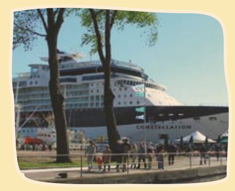
Constellation vessel in Klaipėda Seaport.

Memelburg Castle was erected on the shore of the Curonian Lagoon and consequently the new city being established was named after it. Later, next to that castle a brick castle was built, which became an inseparable part of the city. The Bishop of Kuršas took up residence in Klaipėda. In 1254, the city was granted the Lübeck Law. The city should have become an important economic, cultural and religious centre, however, over time Klaipėda became a prov-