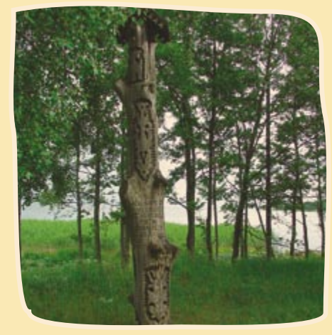
Wooden monument to Liudvikas Gediminas Rėza.

derived from the Curonian word "vece" meaning "old" and "kruogs" meaning "inn", remembering the inn which once was located at the foot of the dune. The dune is covered with mountain pines. From the top of the dune you can see Bulvikis, Preila Didysis and Mažasis, Ožka, Pervalka, Žirgai and Grobštas horns stretching into the Curonian Lagoon.