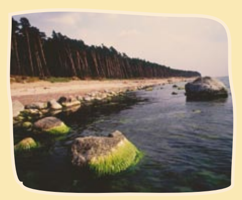
Seacoast Regional Park.