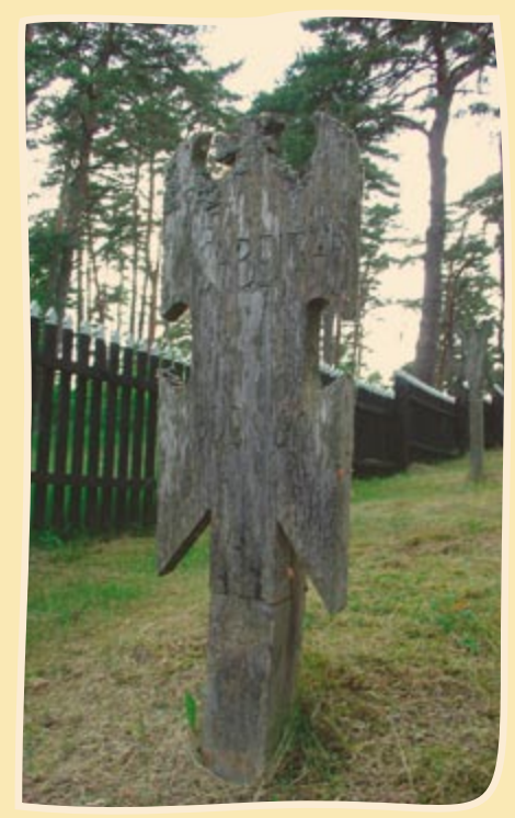
Ethnographic cemetery with wooden crosses in Nida.