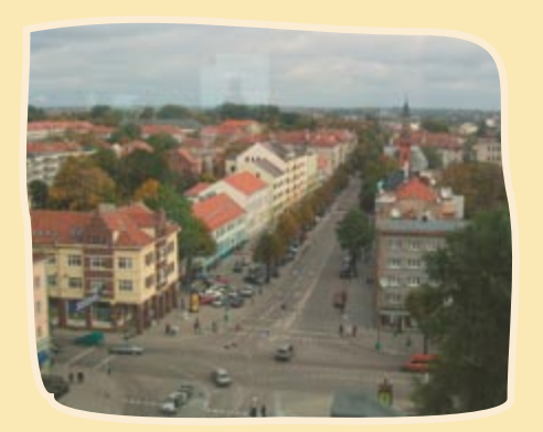
Panorama of Klaipėda.

A multicultural nature was characteristic of Klaipėda in the Middle Ages. Until 1620 there were Lithuanian and German Evangelist churches in Klaipėda and the English, Scotsmen, Dutchmen, and Danes were making their homes there. The main business of the inhabitants was related to trade and the sea. In the sixteenth century wealthy merchants started building seagoing vessels that were used for foreign trade.