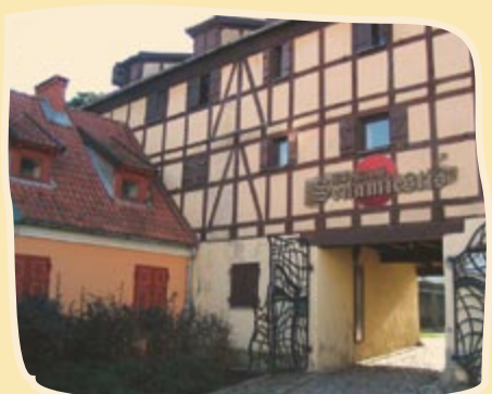
Fachwerk of Klaipėda.

taking up quarters there and many a time the city was rebuilt with their money after fires. Wars with Sweden in the seventeenth century had a great impact on the urbanisation of Klaipėda - the city was extended and surrounded by bastions. The Old Town and Odu districts, as well as Krūmamiestis, a less prestigious suburb of craftsmen, merchants and innkeepers on the other side of the Dane River, formed. Later on more neighbouring suburbs were annexed. After half the inhabi-