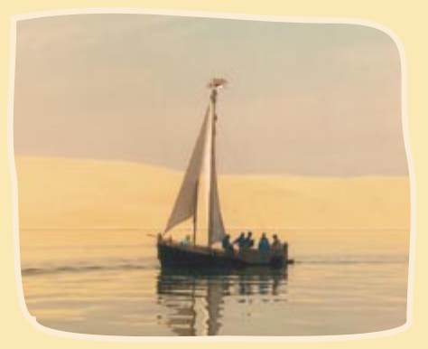
Going on a trip by local kurėnas.