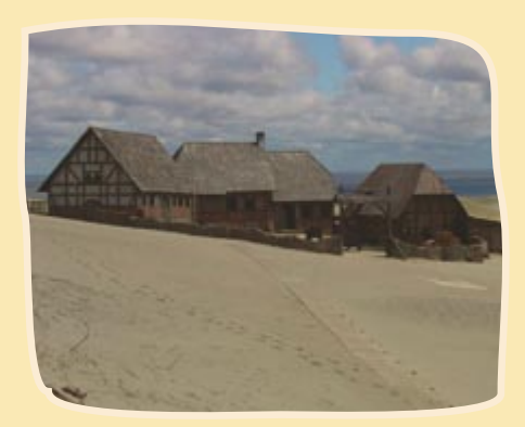
Dunes of the Curonian Spit.

castles were built there. After the Battle of Žalgiris (Grünwald), German colonists started to take up residence in Nerija and in the sixteenth-seventeenth centuries residents from Kuršas and Lithuania moved there. A transit road between Karaliaučius and Riga had an impact on the nature of local settlements – coach houses and inns were opened there. Fishermen's farmsteads nestled up to them. Specific geographical conditions determined a closed way of life. Each settlement