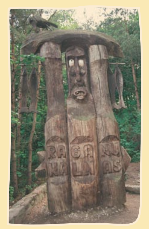
Raganų kalnas (Witches' Hill) in Juodkrantė.

along the bicycle trail separated from the road by a white solid line. At the information stand you turn into a separate cycle trail and go on through the Nagliai Nature Reserve (Naglių gamtos rezervatas). At first you go along the seashore between the forest and the protective dune, then turn into the forest, go 400 m to the Klaipėda–Nida Road (No. 167) and ride along the side. Cross this road at the rest area, where a pedestrian path leads to the Grey Dunes (29).