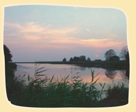
Sunset on the Rusne Island.

the Soviet era, has been slow in recovering, however you can see rare birds and various water plants and animals typical of the locality. Due to constant floods life in these villages has always been complicated, but breathtaking beauty and endless latitude of water attract both native and foreign tourists to the land.