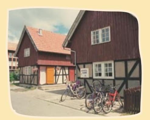
Old homesteads in Nida.

beginning of the 17^{\text{th}} century. Early in the 17^{\text{th}} century Nida was the first to be buried under sand and its residents moved towards the Curonian Lagoon, however a hundred years later that place was also buried under sand. It was only at the beginning of the 18^{\text{th}} century that residents of Nida moved to the present-day location where a post office (moved there from Kuncai, which was buried under sand) and a school (1743) were opened. The number of residents began to grow.