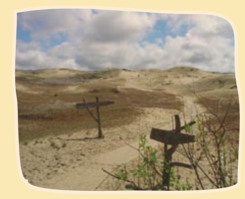
Path in the Nagliai Nature Reserve.

• (29) A trail in the Nagliai Nature Reserve is a pedestrian path made of boards winding through the reserve, which runs for 9 km between Juodkrantė and Pervalka. You can see the Grey Dunes (also referred to as the Dead Dunes (Mirusios Kopos)) and from their top a spectacular view of the Baltic Sea, the Curonian Lagoon and the Nemunas Delta opens. Lithuanians often call this place the Lithuanian Sahara.