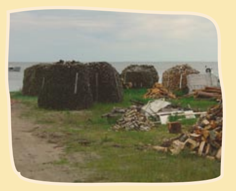
Near the Curonian Lagoon in Nida.